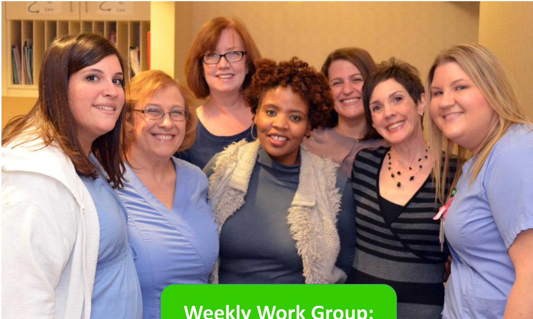
Weekly Work Group: Care Coordinator Team