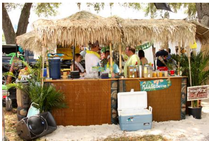
Figure 6: Business suits for the day job are replaced by leis and T-shirts for a Jimmy Buffett concert.