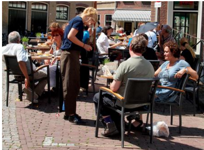
Figure 7: Is she a working waitress or a sociologist conducting a study using participant observation?

Rothman had conducted a form of study called participant observation , in which researchers join people and participate in a group’s routine activities for the purpose of observing them within that context. This method lets researchers experience a specific aspect of social life. A researcher might go to great lengths to get a firsthand look into a trend, institution, or behavior. Researchers temporarily put themselves into roles and record their observations. A researcher might work as a waitress in a diner, or live as a homeless person for several weeks, or ride along with police officers as they patrol their regular beat. Often, these researchers try to blend in seamlessly with the population they study, and they may not disclose their true identity or purpose if they feel it would compromise the results of their research.