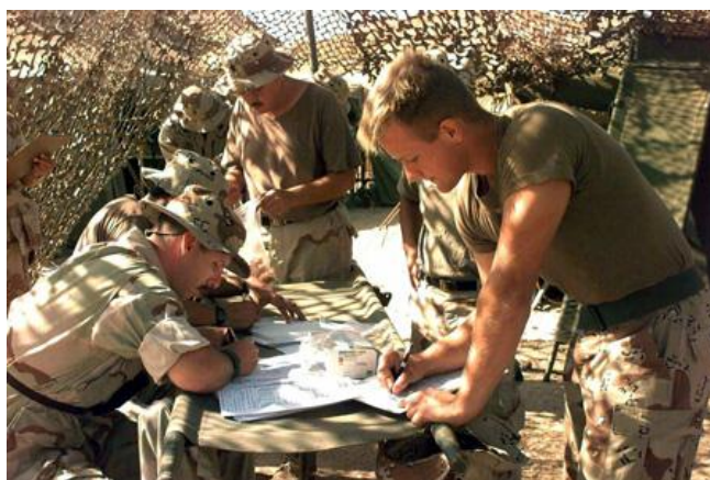
Figure 4: As part of a malaria pill study, U.S. Navy Hospital personnel complete a questionnaire on health issues they experienced in Somalia. Participants submitted a blood sample as part of this study, which supported Operation Restore Hope.

Sociologists conduct surveys under controlled conditions for specific purposes. Surveys gather different types of information from people. While surveys are not great at capturing the ways people really behave in social situations, they are a great method for discovering how people feel and think – or at least how they say they feel and think. Surveys can track preferences for presidential candidates or reported individual behaviors (such as sleeping, driving, or texting habits), or factual information such as employment status, income, and education levels.