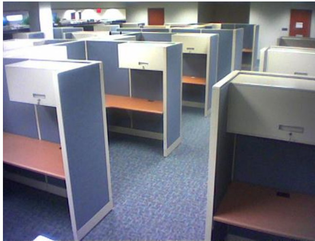
Figure 8: Field research happens in real locations. What type of environment do work spaces foster? What would a sociologist discover after blending in?

Nickel and Dimed: On (Not) Getting By in America , the book she wrote upon her return to her real life as a well-paid writer, has been widely read and used in many college classrooms.