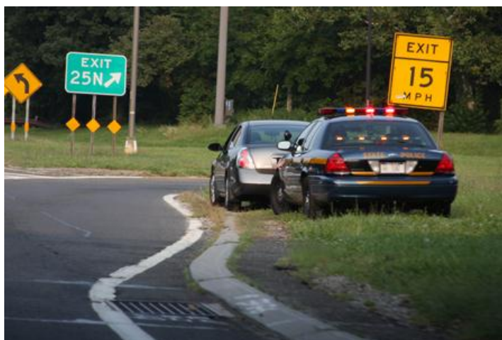
Figure 10: Sociologist Frances Heussenstamm conducted an experiment to explore the correlation between traffic stops and race-based bumper stickers. This issue of racial profiling remains a hot-button topic today.