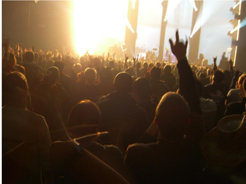
Figure 1: Concertgoers enjoy a show. What makes listening to live music among a crowd of people appealing? How are the motivations and behaviors of groups of people at concerts different from those of groups in other settings, such as theme parks? These are questions that sociological research can aim to answer.

This work is produced by The Connexions Project and licensed under the Creative Commons Attribution License