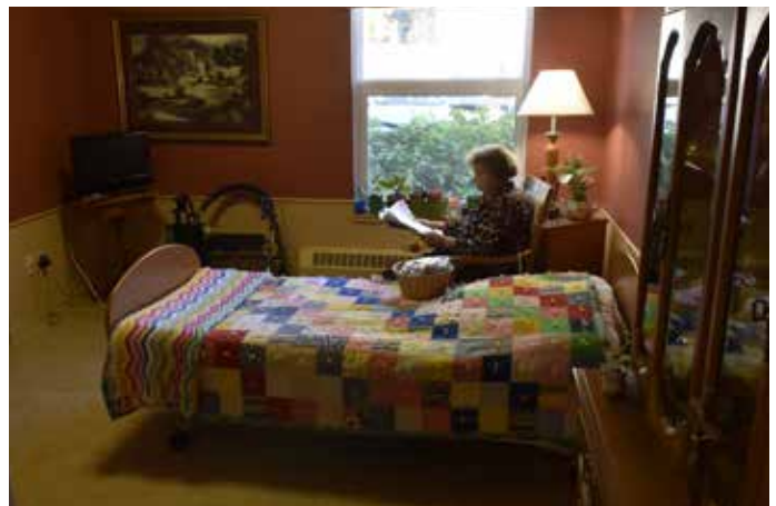
New long-term care home design standards include the elimination of three- and four-bed wards (TOP) in favour of more comfortable, home-like private rooms with washrooms, enhancing care and providing dignity (ABOVE).