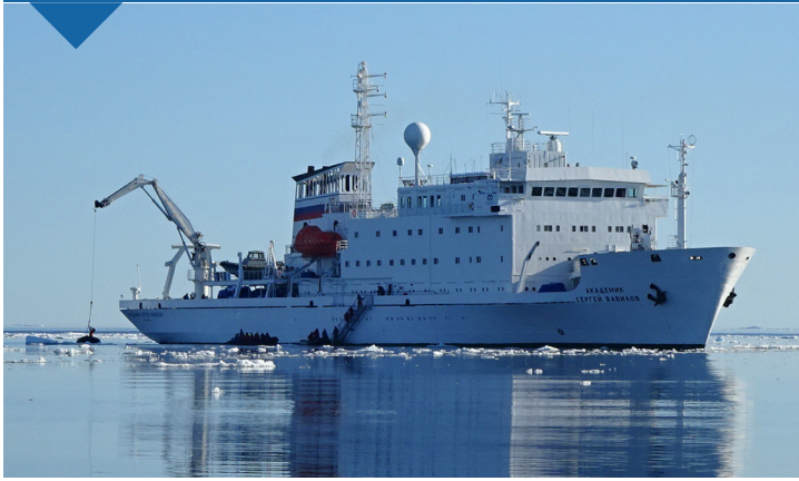
Akademik Sergey Vavilov (One Ocean Voyager)

Akademik Sergey Vavilov is the perfect size ship for visiting Antarctica. She carries no more than 92 passengers. This is under the maximum number of people allowed on shore (100), as mandated by the regulatory organization for tourism activities in Antarctica (IAATO). Being under this limit, means you will spend the maximum amount of time on shore, on EVERY single excursion. Once on shore, we break up into smaller special interest groups, with several hiking options, perhaps a visit to a penguin rookery, a historic site or a quiet stroll along the shoreline contemplating the magic. You decide how your day unfolds. Your time in Antarctica is precious and we aim to maximize your experience at every opportunity. To learn more about this exceptional vessel, request a copy of the Ship Fact Sheet containing detailed specifications and additional information about cabins and other facilities.