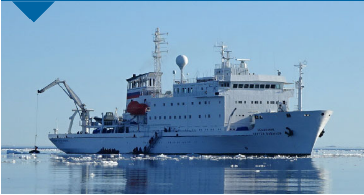
One Ocean Voyager (Akademik Sergey Vavilov)

Akademik Sergey Vavilov is the perfect size ship for visiting Antarctica. She carries no more than 92 passengers. This is under the maximum number of people allowed on shore (100), as mandated by the regulatory organization for tourism activities in Antarctica (IAATO). Being under this limit, means you will spend the maximum amount of time on shore, on EVERY single excursion. Once on shore, we break up into smaller special interest groups, with several hiking options, perhaps a visit to a penguin rookery, a historic site or a quiet stroll along the shoreline contemplating the magic. You decide how your day unfolds. Your time in Antarctica is precious and we aim to maximize your experience at every opportunity. To learn more about this exceptional vessel, request a copy of the Ship Fact Sheet containing detailed specifications and additional information about cabins and other facilities.