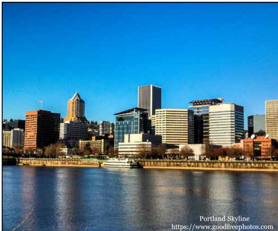
Portland Skyline