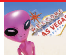
MARS SOCIETY Follow the action from the meeting of Mars enthusiasts in Boulder, Colorado. www.nature.com/news