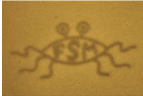
Bacterial photograph showing the existence of an intelligent designer (2005 iGEM from UT Austin)