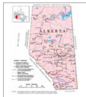
Figure 1. The province of Alberta and its location within Canada.

The SIB Alberta Ingenuity Fund (AIF) works to foster a rich and diverse bioeconomy in Alberta. As part of this effort, it is creating five $100M Accelerators in advanced technologies, including nanotechnology and information and computer technology. Synthetic biology – a potentially disruptive technology that aspires to programming life forms rapidly, cheaply, and reliably – is under consideration as an emerging cornerstone platform for Accelerator development.