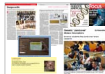
Figure 3. Examples of iGEM-related media coverage. iGEM work enjoys a positive media bias although involving genetically-modified organisms.