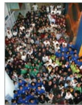
Figure 2. Some of the 350 student participants at the 2006 iGEM competition.

At the start of each competition, which runs from May to November, teams are provided with a distribution of available parts from the Registry of Standard Biology Parts (the Registry), as well as access to online resources describing their specifications, use, and end-user experiences. Teams use these parts to create biological machines of their own design. If necessary, new parts can be created using BioBrick design rules. Competition rules dictate that data and new parts be deposited in the Registry, creating a positive feedback loop. Teams seek independent funding, distributing operational costs.