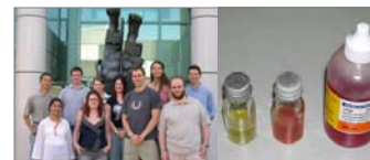
Figure 5. Towards commercialization: The 2006 Edinburgh iGEM team (left) and the bacteria-based biosensor they developed to test for arsenic water contamination. If approved, the test could significantly improve arsenic detection yet cost only pennies per use.