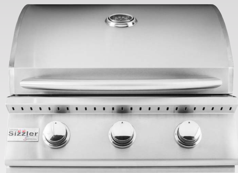
SIZZLER 26" GRILL SIZ26

Quality you can afford. The Sizzler Series is a premium product at an unbeatable price. Constructed in all #443 stainless steel* and designed with careful precision to ensure optimal airflow and even heating, this grill gives its higher—priced competitors a run for their money in both durability and grilling performance. The Sizzler will impress the most discriminating of grillers.