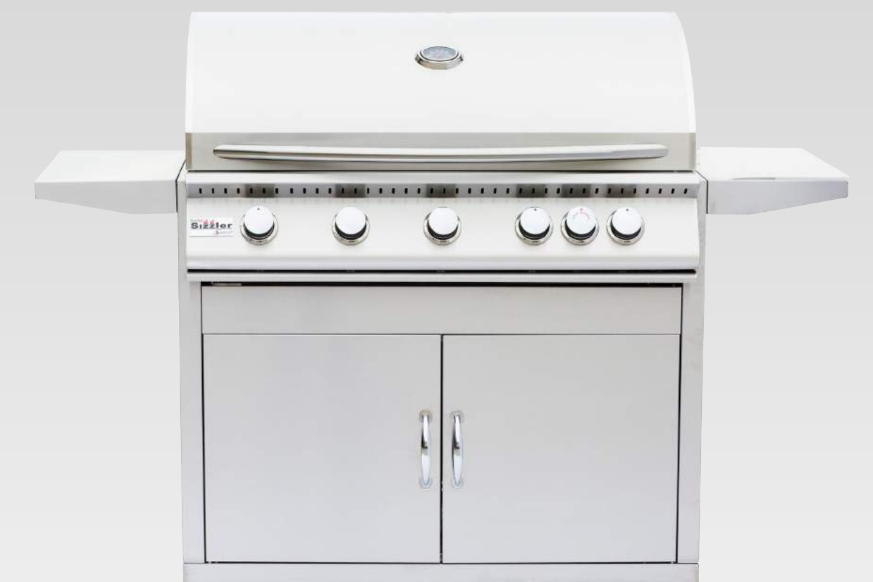
SIZZLER CART CART-SIZ

Cooking Surface: 985 sq. in. Coutouts: (W) 38 x (H) 8 1/2 x (D) 20 3/4