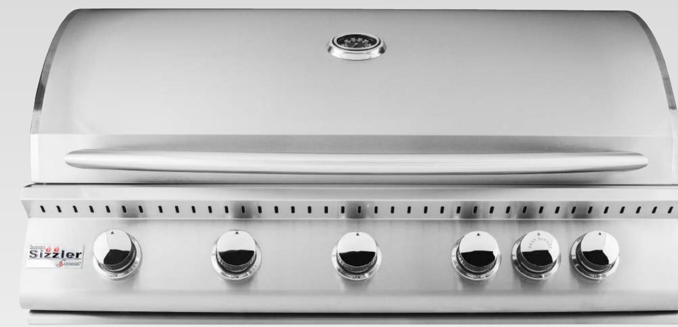
SIZZLER 40" GRILL SIZ40

Cooking Surface: 795 sq. in. Coutouts: (W) 30 5/8 x (H) 8 1/2 x (D) 20 3/4