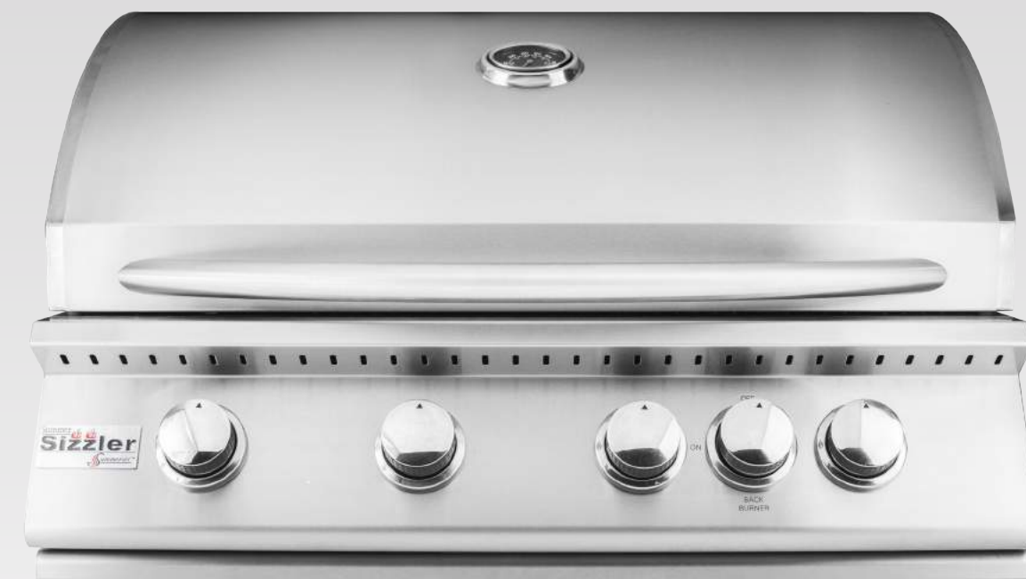
SIZZLER 32" GRILL SIZ32

Cooking Surface: 550 sq. in. Coutouts: (W) 23 3/4 x (H) 8 1/2 x (D) 20 3/4