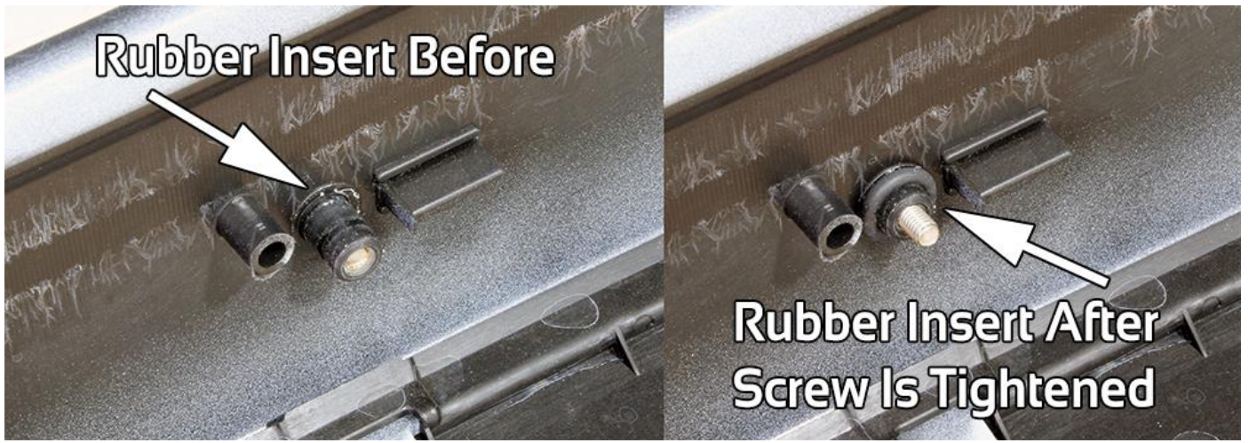
Picture above shows what insert looks like from behind the bumper.