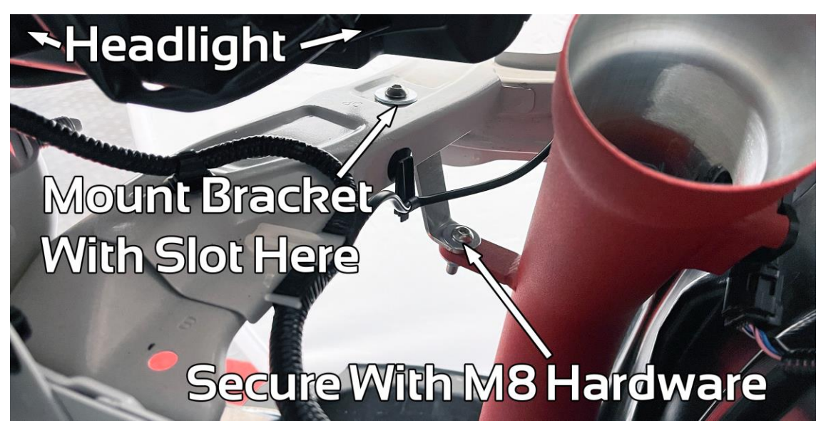
Bumper is shown removed in the above picture. This is done for illustration purposes only.

15. Using the next two pictures for reference, locate hole in chassis just below the headlight as shown below. Install supplied bracket (slot side up) with spacer to hole on chassis and secure with supplied M8 screw, washers and nut. Leave hardware loose at this time.