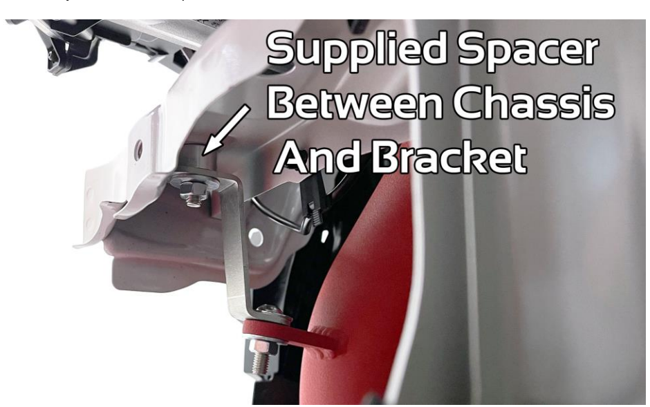
Bumper is shown removed in the above picture. This is done for illustration purposes only.

16. Using the pictures above and below for reference, install remaining M8 hardware and secure bracket to PERRIN Intake Pipe. Tighten hardware using fingers as this will need to be adjusted in a later step.