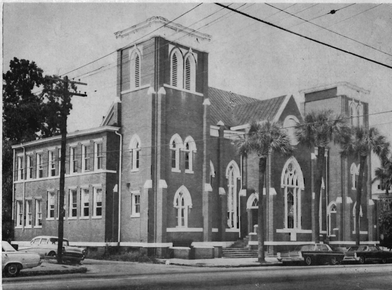
ASBURY METHODIST CHURCH Savannah, Georgia May 1-5, 1967