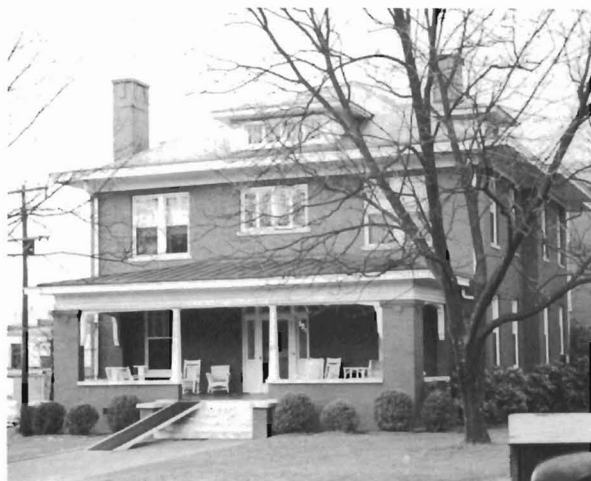
PARSONAGE BUILT IN 1916