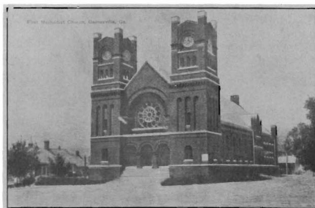
FIRST CHURCH IN 1907