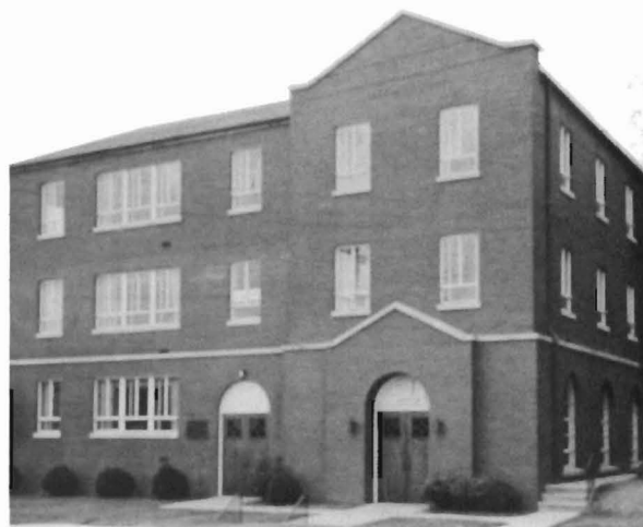
ANNEX COMPLETED IN 1951