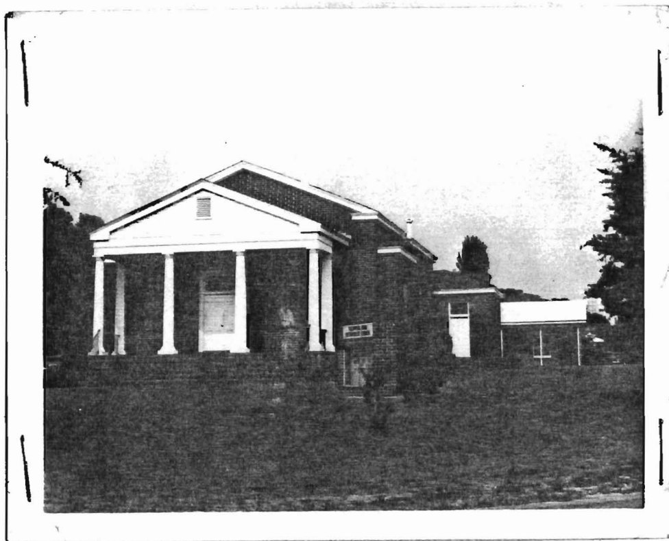
PALMYRA ROAD METHODIST CHURCH (formerly Grace Methodist Church), located on Palmyra Road and Tenth Avenue.