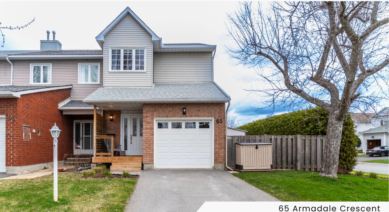
65 Armadale Crescent Ottawa K2J 3Z3

Welcome to this stunning corner unit townhome nestled in a quiet, family-friendly crescent within a sought-after neighbourhood. Extensively renovated with exquisite finishes, this home welcomes you with a modern front foyer featuring ceramic tile. It boasts luxurious laminate and ceramic tile flooring throughout. The open concept design includes a spacious eat-in kitchen, large dining area, and living room with a cozy gas fireplace and large windows for abundant natural light. Step out through the patio doors to a private, fenced backyard paradise, complete with a patio, terrace, gazebo, and above-ground pool. The primary suite features a large bedroom with scenic windows, a walk-in closet, and a modern 3-piece ensuite. Two additional bedrooms offer ample space, large closets and windows. An upgraded family bath is also found on the second floor. The bright lower level family room and extensive storage space make this home both practical and inviting. Conveniently located near transit, parks, shops, and schools, this move-in-ready home awaits.