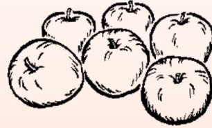
Plural – apples

A Read the singular nouns to your teacher.