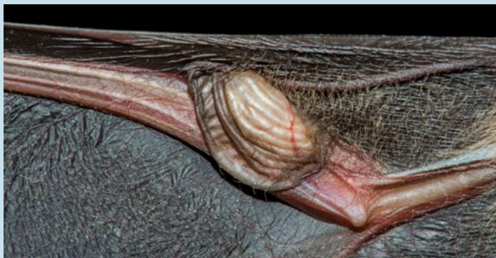
Underside of the scent sack in the wingpit area.