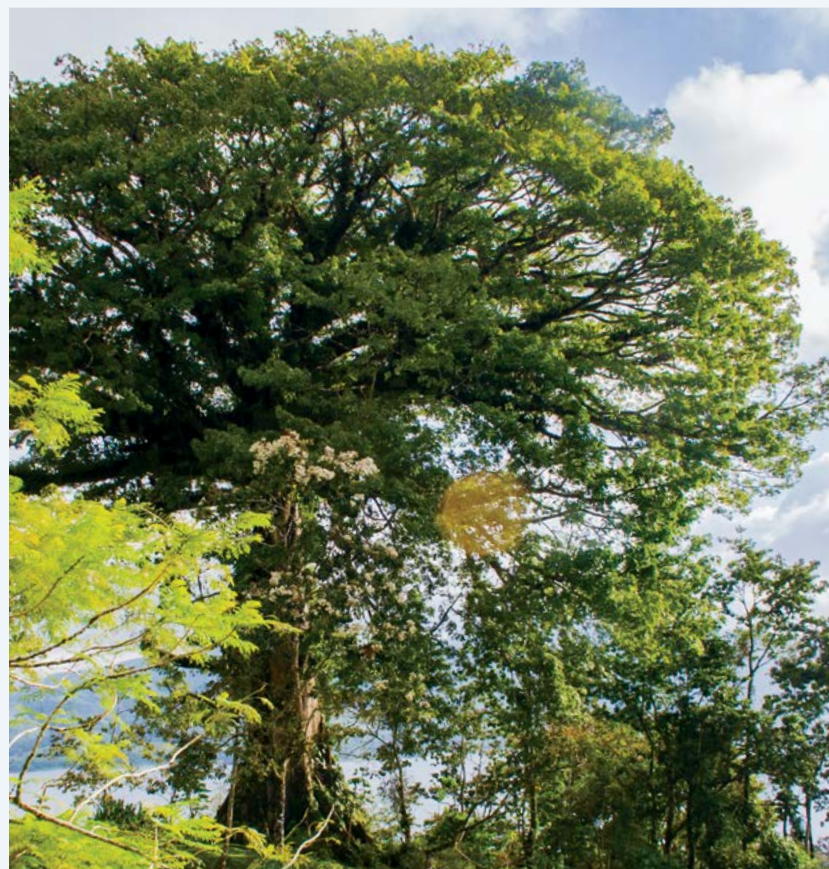
The original ceiba tree on Peaceful Mountain.

I called my son over, and he started taking these photos. But he had a real problem. Every time he got close enough and focused the camera, the bats dropped. That is their unique way of escaping. Finally my son stepped up on a low buttress and reached into their