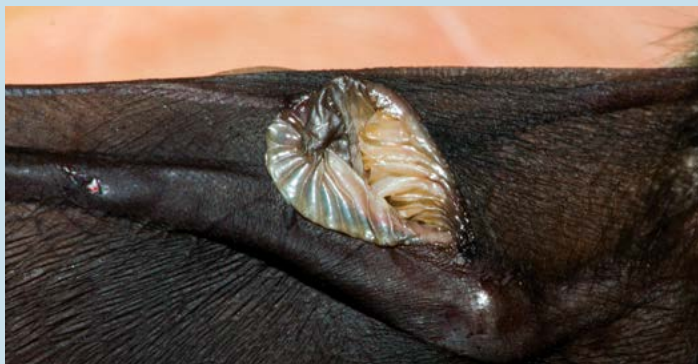
Upper side of scent sack. One opened. One closed.