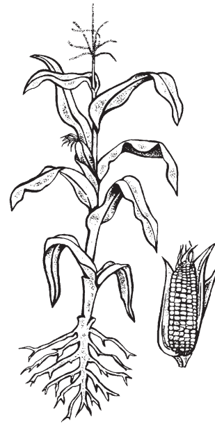
Figure 8: Zea mays

Along with the information that classification gives, take note of the Latin clue endings for taxa. For plants, -ophyta is a division ending, -ae or -eae is a class ending, -ales is an order ending, and -aceae is the usual family ending. Notice also that all taxa names are italicized (or underlined) and that the species name also includes the genus name.