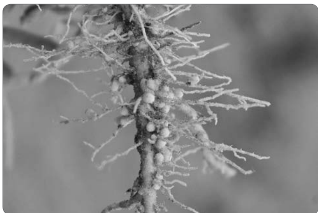
Nodules on legume roots.

Still another way nitrogen is removed from the soil is by bacteria. Some bacteria fix nitrogen in the soil, but other kinds of bacteria remove it from the