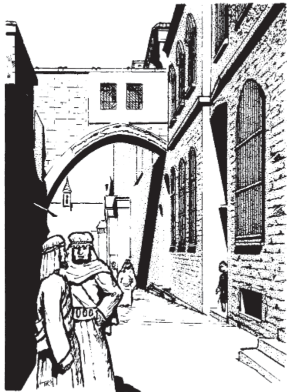
Jews and Arabs lived in relative peace in 1000 A.D.

Seven major crusades followed from 1095 to in 1270, plus minor expeditions before and after those dates. Although some of the most famous men of Europe were identified with the crusades, so were the lowest elements of European society. For peasants, the crusades offered relief from the dull routine of life.