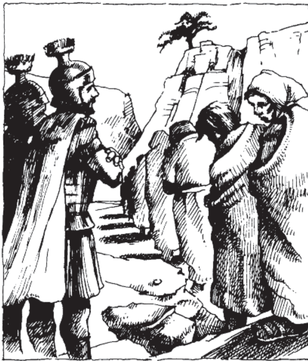
The Romans made slaves of many Jews.

The second Jewish revolt. The exile began for the Jews in A.D. 70 with the survivors of Titus' conquest. Yet the tenacity of these people would be demonstrated in another revolt. In