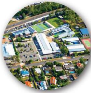
Primary Campus 109 Golda Avenue Salisbury Qld 4107