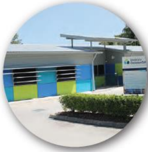
Pre-Prep Centre 28 Rookwood Avenue Coopers Plains Qld 4108