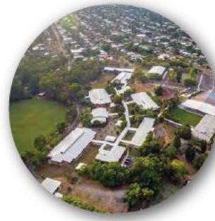
Middle and Secondary Campus 63 Fairlie Terrace Salisbury Qld 4107

PO Box 177, Salisbury, Qld 4107, Australia Telephone +61 7 3719 3111 Email office@brisbanechristiancollege.com.au brisbanechristiancollege.com.au