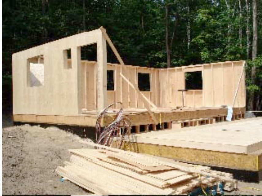
Rear walls framed up, starting on front walls