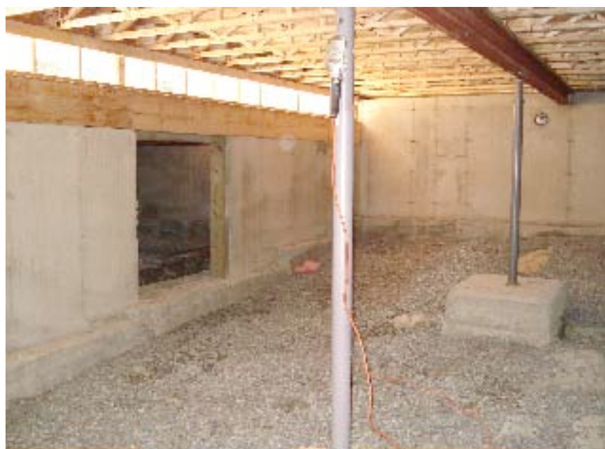
Basement – showing split level floor and support beam – looking SE