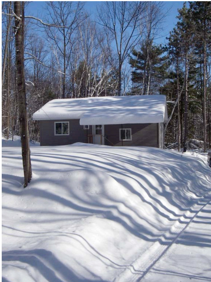
Cedar Cottage - Exterior complete for winter – seen from driveway to cottage