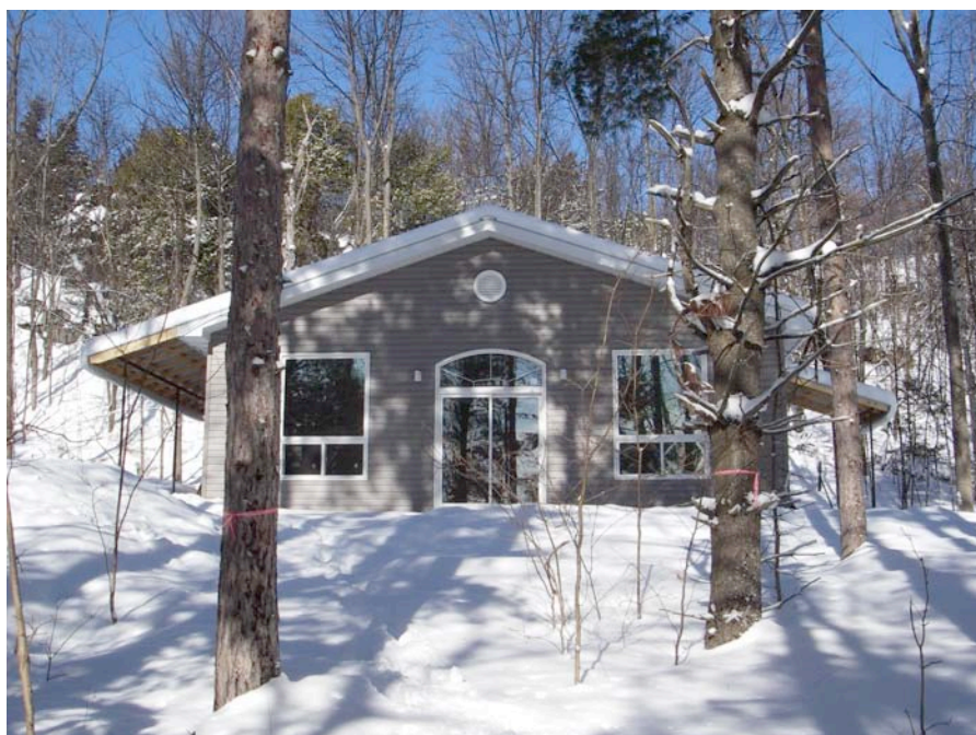
Cedar Cottage - Exterior complete for winter – Lake View