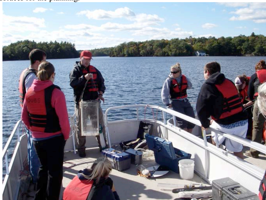
New pontoon boats in action during Limnology weekends – Fall 2007

It seems that the Boardwalk (initially built in 1984) to Cow Island needs a bit of work each year to keep it functional. We replaced some of the top planking this year, and devised a means of using through-bolts to replace many of the crossbraces for the planking.