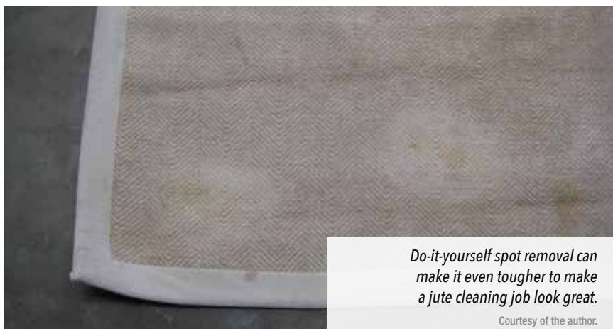
Do-it-yourself spot removal can make it even tougher to make a jute cleaning job look great.

If the rug is anchored down with heavy furniture, the edges can stretch out of shape in the home. If the rug is given a full wash and moved around without careful handling when wet,