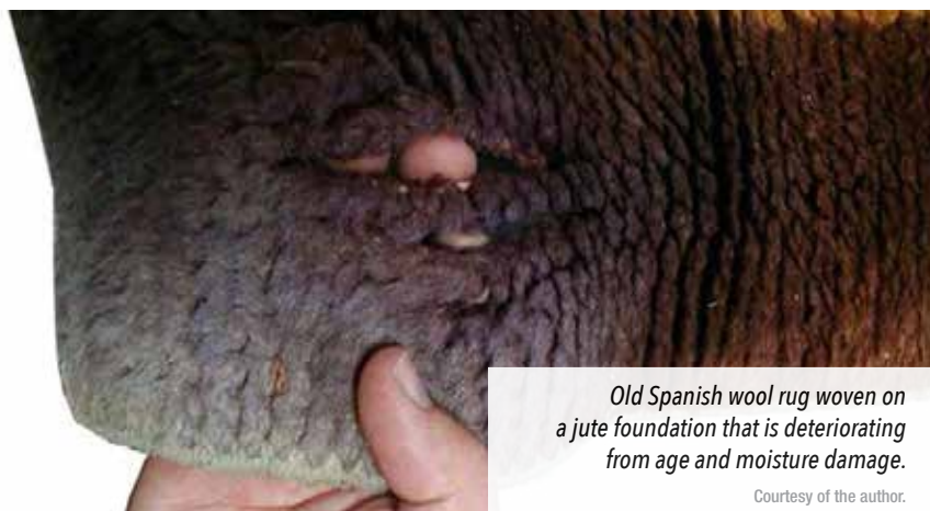
Old Spanish wool rug woven on a jute foundation that is deteriorating from age and moisture damage.