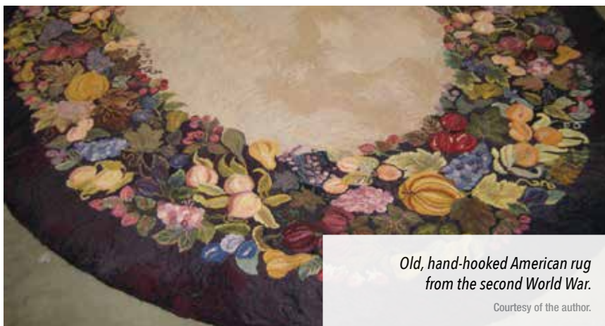
Old, hand-hooked American rug from the second World War.

Jute does not give a wow when cleaned the way wool does, it does not have a great soil-hiding capacity,