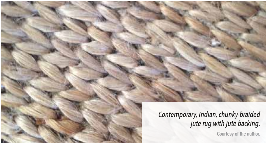
Contemporary, Indian, chunky-braided jute rug with jute backing.

“The longer a jute rug takes to dry, the more problems can arise.”