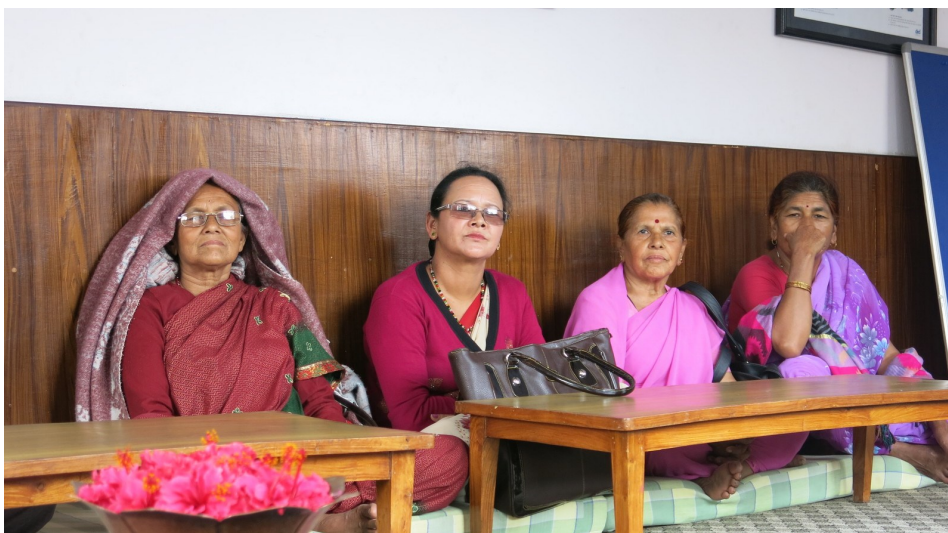
Bindis from Khatmandu