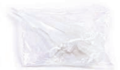
Competitors Non-Sterile Pouch