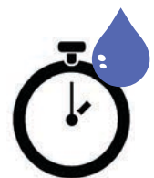
Competitors 8+ seconds