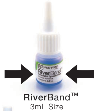
RiverBand™ 3mL Size

RiverBand™ bottle is redesigned in a larger size to hold more glue and provide more dispensing comfort.