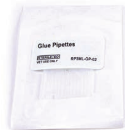
RiverBand™ Sterile Pouch

The disposable applicators come in a sterile pack, which compared with the competition, can make a difference in an effort to reduce bacterial migration into the surgery site. The tip fits snugly into the tip on the bottle and allows greater control over the size and placement to the drop of product.