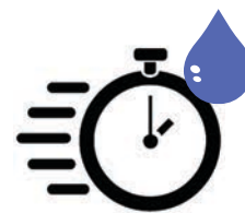
RiverBand™ 5+ seconds

RiverBand™ Surgical Adhesive dries clear for clean appearance. It sets up quickly (5-15 seconds) and dries flexible for maintaining closure on wound site.