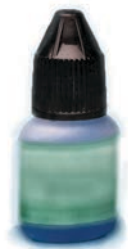
Competitors Dull Purple