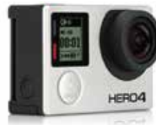
GoPro Hero 3 & 4* Mount Only