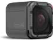
GoPro® Hero5 Session* Mount Only