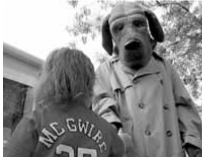
McGruff shakes hands with one of the local children, from a participating neighborhood.

National Night Out (NNO) was celebrated on August 1, 2000 by seventeen different neighborhoods in Fairfield. This type of celebration has become a tradition the first Tuesday in August for many of the established Neighborhood Watch groups in Fairfield. It helps solidify relationships within their neighborhoods and with the police. Over the years, these close-knit groups have formed alliances that seem to work for the people in these areas. Each year new groups host NNO gatherings (whether they start up in new housing developments, or are establishing new Neighborhood Watch groups in older neighborhoods). These groups are just getting started in the area of working together to build a "sense of neighborhood."