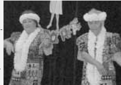
Performers dance from the Na Kupuna Wahine O'Malia group.

Prizes were awarded for the best-dressed contestants. Kaiser Permanente provided the many door prizes and the Fairfield-Suisun Senior Citizens Club assisted with the preparations and serving. □