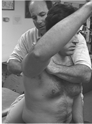
Shoulder Elevation MWM

Impairment: Limited and Painful Shoulder Elevation