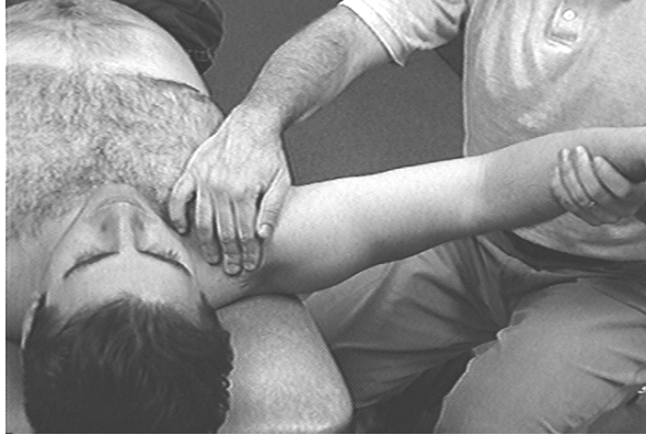
Glenohumeral Abduction ROM Measurement