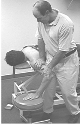
Humeral Anterior Glide

Impairment: Limited Shoulder Elevation Limited Glenohumeral External Rotation Limited Humeral Anterior Glide