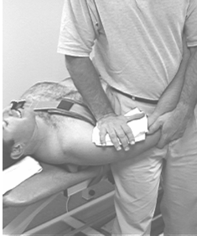
Humeral Posterior Glide

Impairment: Limited Shoulder Hand Behind Back Motions Limited Glenohumeral Internal Rotation Limited Humeral Posterior Glide