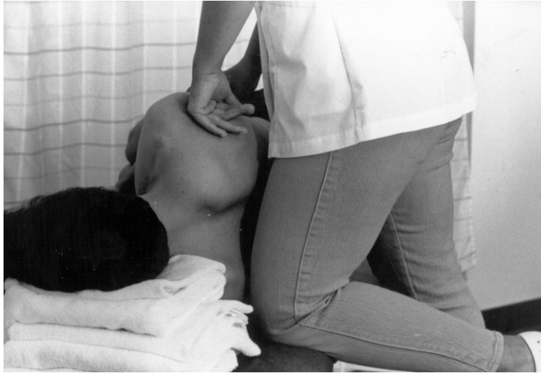
Infraspinatus Soft Tissue Mobilization