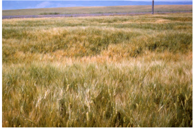
Figure 2. Wheat affected by cereal cyst nematode.