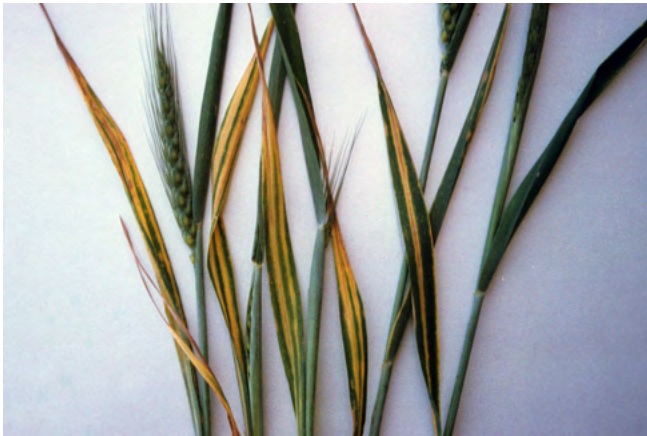
Figure 3. Leaf banding caused by Cephalosporium stripe.