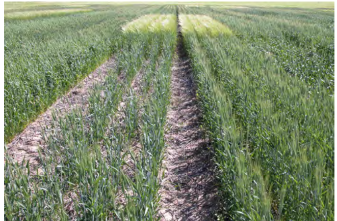
Figure 10. Root-lesion nematode reduced the plant vigor of wheat unprotected by an experimental nematicide. Note the equal growth of barley in unprotected (left) and protected (right) drill rows.