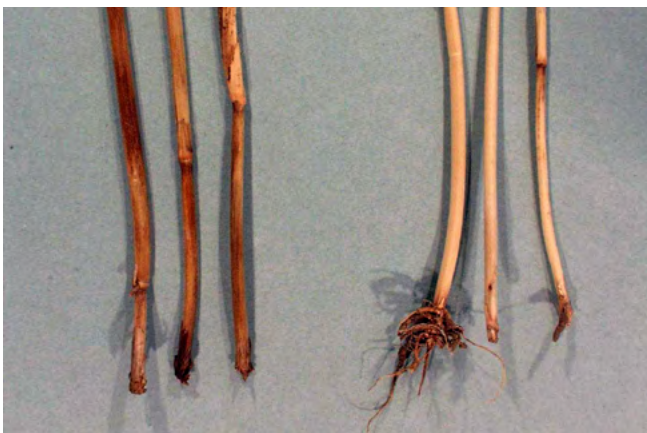
Figure 5. Honey-brown discoloration of lower nodes (left) caused by Fusarium crown rot.