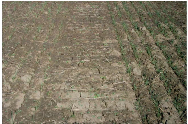
Figure 8. Pythium damping-off greatly reduced the stand of wheat unprotected by seed treatment (left) compared to the stand grown from seed treated with fungicide (right).