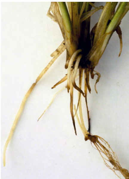
Figure 11. Crown roots severed by Rhizoctonia root rot (bare patch).