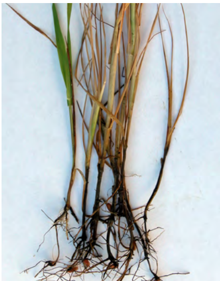
Figure 15. Blackened roots and lower stems and seedling death caused by take-all.