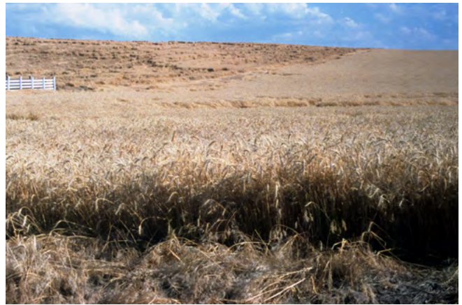
Figure 14. Wheat lodging caused by strawbreaker foot rot (eyespot).