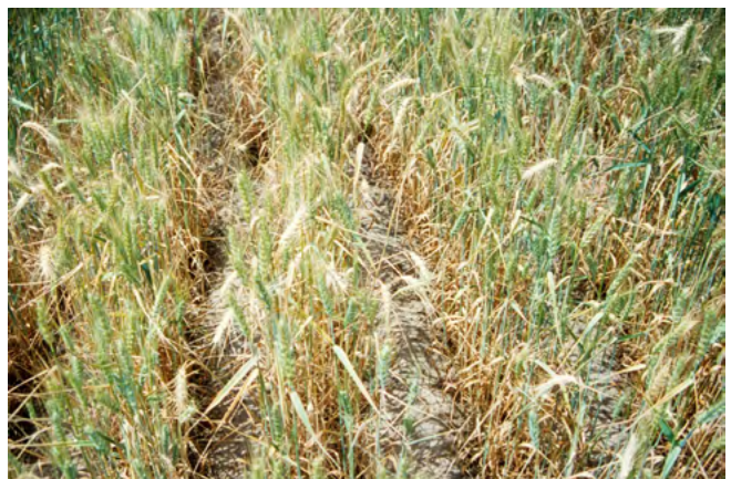
Figure 6. Whiteheads caused by Fusarium crown rot.