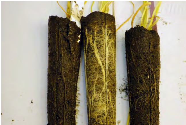
Figure 9. Roots deteriorated by root-lesion nematode (left and right) compared to roots of a resistant wheat landrace breeding line (center).