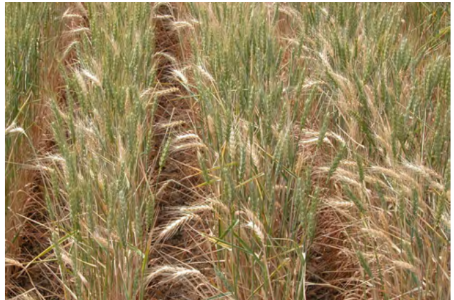
Figure 4. Whiteheads caused by Cephalosporium stripe.