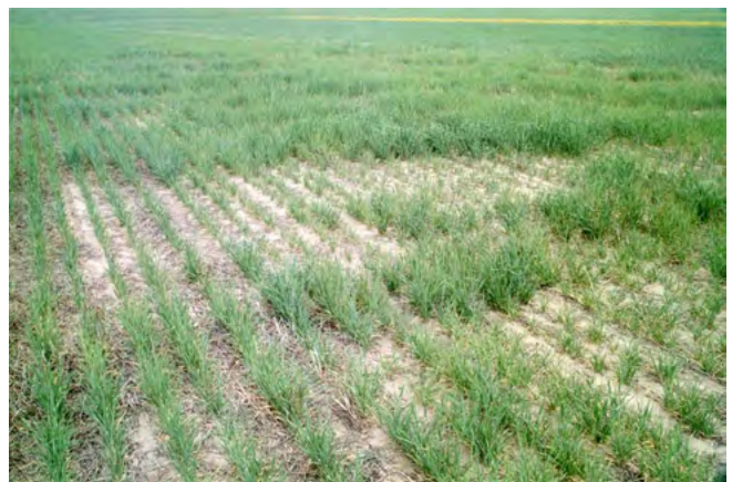
Figure 12. Rhizoctonia root rot (bare patch) of wheat.