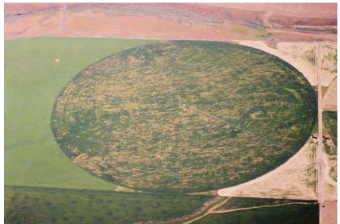
Figure 16. Irrigated wheat with extensive stand failure caused by take-all.