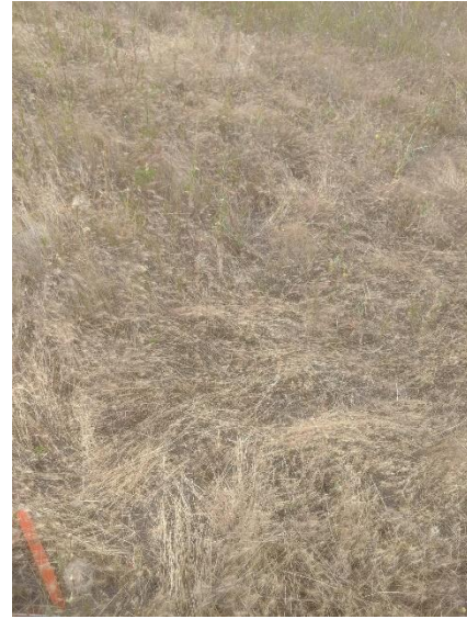
Figure 1. Nontreated control of ICB0417. Contains medusahead, prickly lettuce, panicle willowweed and Idaho fescue.

Percent cover for invasive annual grasses and desirable perennial grasses were visually assessed 7, 8, 22, and 34 months after treatment (MAT) (Table 2, 3, 4, & 5). First-year biomass for all species was collected August 8, 2018 and then sorted in the lab for assessment 21 months after treatment (MAT) (Table 5). The second- and third-year biomass for all species was collected August 8, 2018 and July 23, 2019, respectively (Table 4 & 5). Biomass was collected using 2 tenth meter squared quadrats randomly thrown in the plot. Cover data was collected using a 4 meter transect separated into 12 points. At each point, plant species were looked at a foot off either side and assessed on a presence/absence basis. All data were subjected to an analysis of variance using the statistical package built into the Agricultural Research Manager software system (ARM 8.5.0, Gylling Data Management).