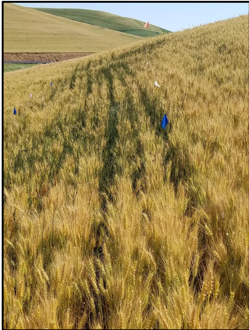
Figure 2. Effect of RT 3 + Silwet L77 (foreground) vs. RT 3 alone and no herbicide one year after treatment.

Applications of RT 3 + Silwet L77 resulted in fewer stems than RT 3 alone (Figure 2) at all locations and application times, except for the May application at PCFS (Table 1). The May PCFS applications of RT 3 alone and RT 3 + Silwet L77 resulted in 8 and 2 stems/yd 2 , respectively, compared with 63 stems/yd 2 for the nontreated check. Furthermore, the RT 3 alone application statistically reduced stem density in only three other instances compared with the nontreated check, the July applications at Edwall and Steptoe, and the August application at Steptoe (Table 1). In addition, the effect of RT 3 alone was much less consistent and resulted in a high amount of variability (data not shown). This variability is the reason why the RT 3 alone treatment is not statistically different than the nontreated check, even though the means appear very different. In contrast, the response from RT 3 + Silwet L77 was much more consistent and less variable. The poor response of RT 3 alone is consistent with previous research and grower reports and is likely due to the inability of smooth scouringrush to uptake enough of the herbicide to make a difference the following year. This barrier is