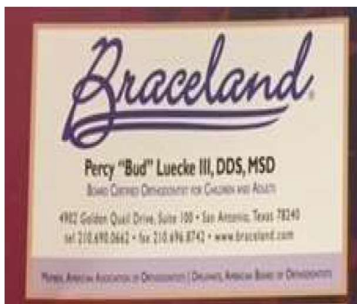
1/8 Page Example (Business Card size)