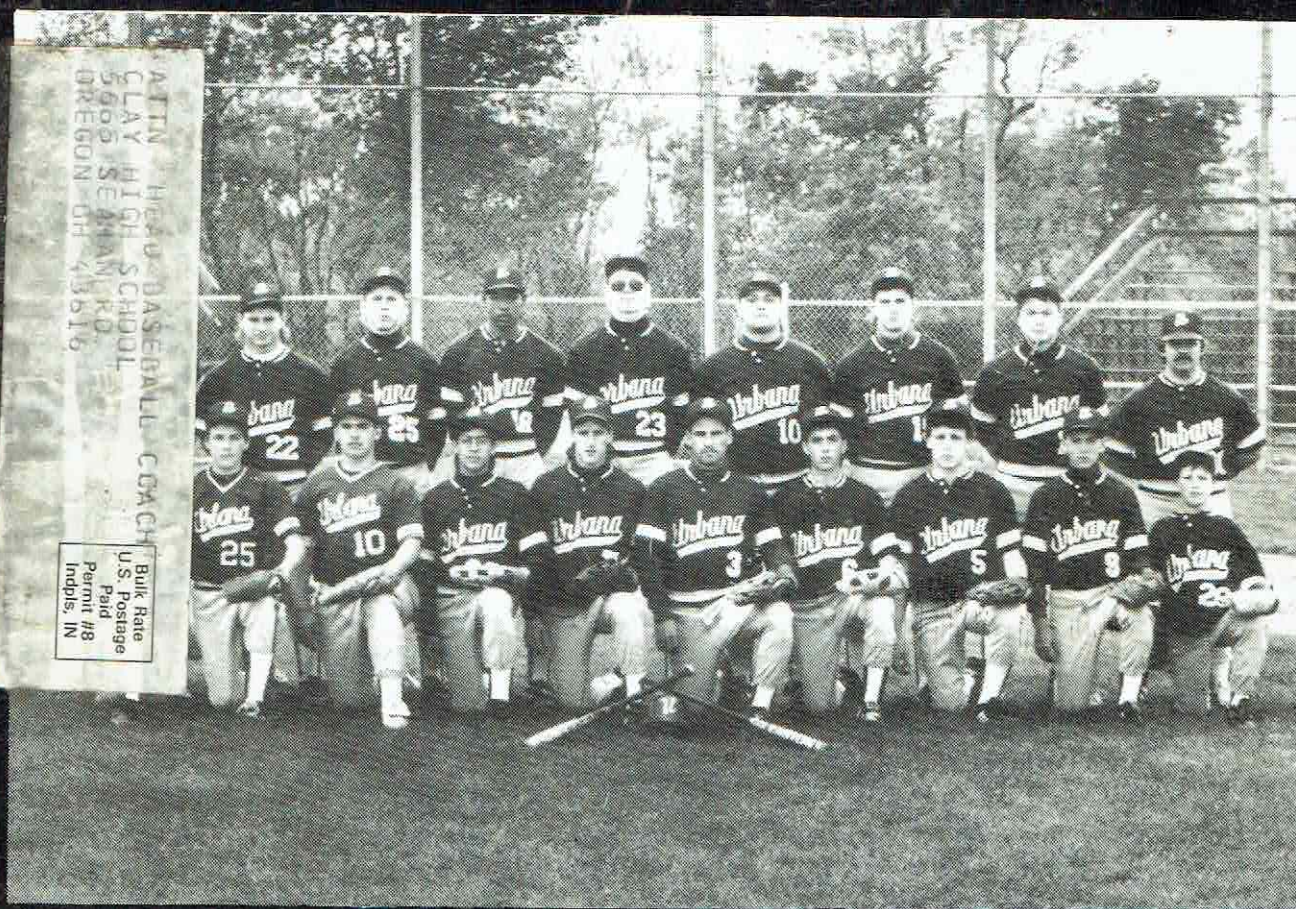
1990 Division II State Champions URBANA HIGH SCHOOL