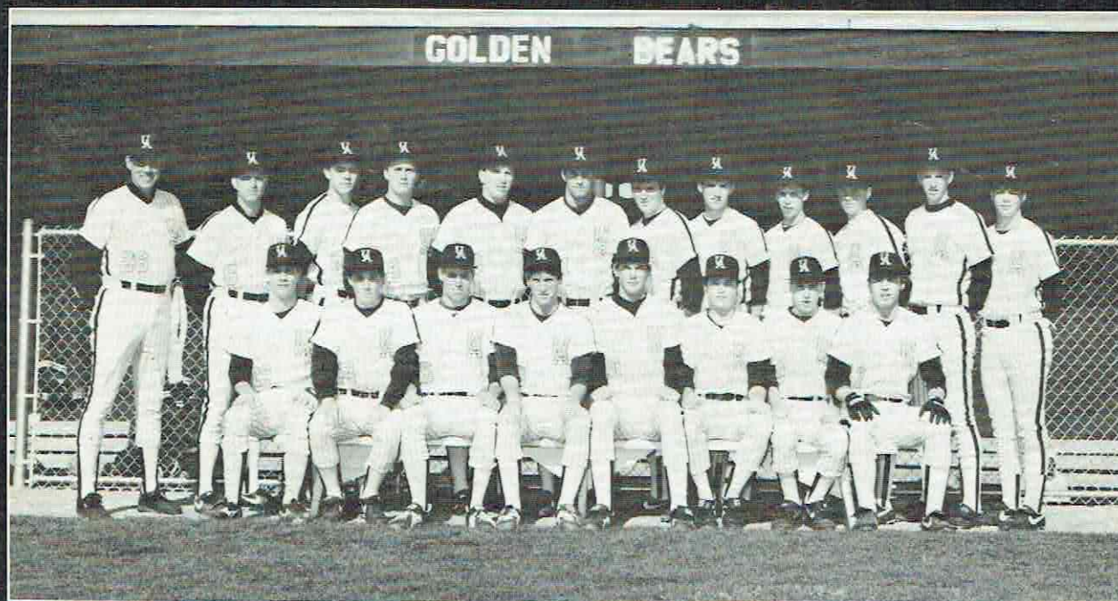
Upper Arlington High School 1987 Class AAA Champions

High School Conference Summaries Coaches Pick Top Teams And Players