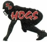
#3 Football Line