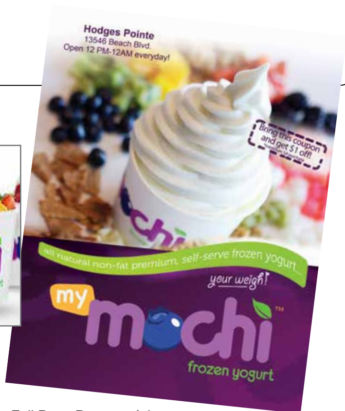
Full Page Program Ad