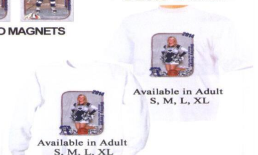
Available in Adult S, M, L, XL