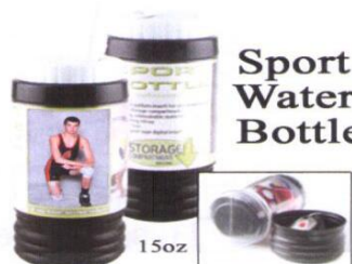
Sport Water Bottle 15oz