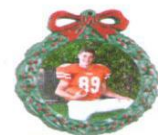
Wreath Tree Ornament