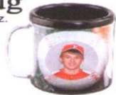
Drink Mug 11oz.