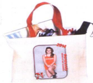
Photo Tote Bags