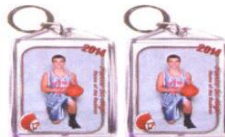
PHOTO KEY CHAINS