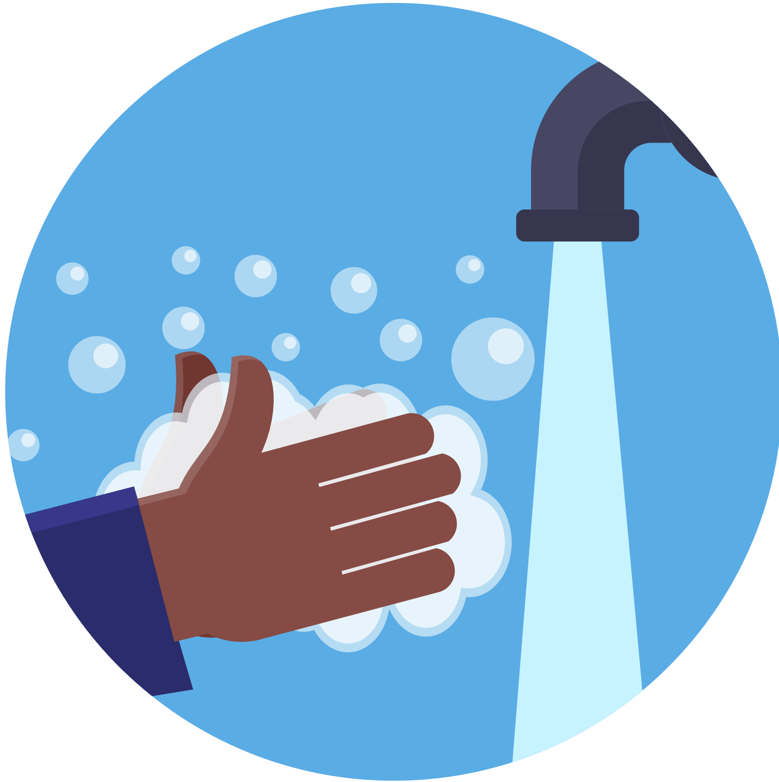
Wash your hands often