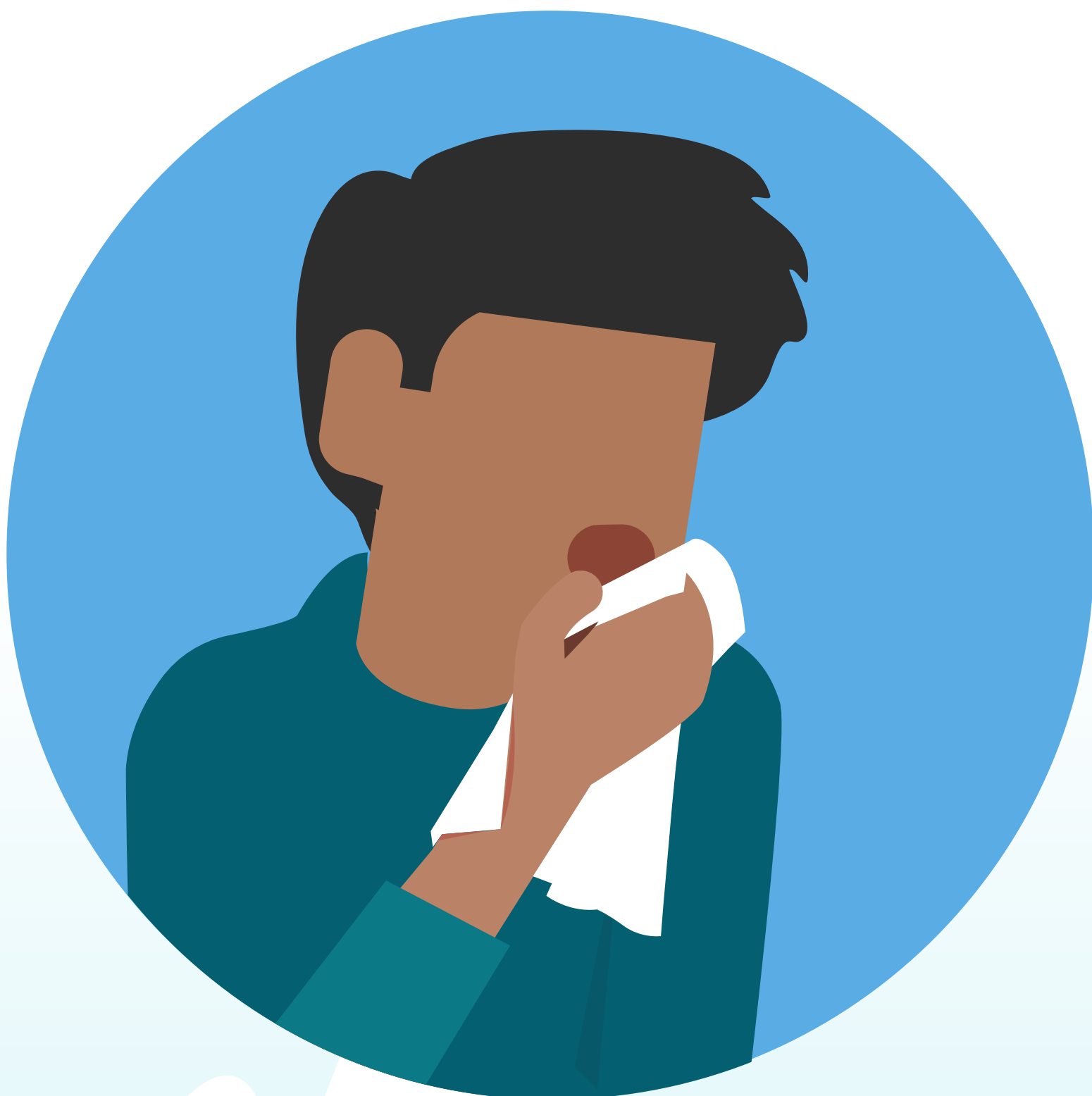
Cover your coughs and sneezes