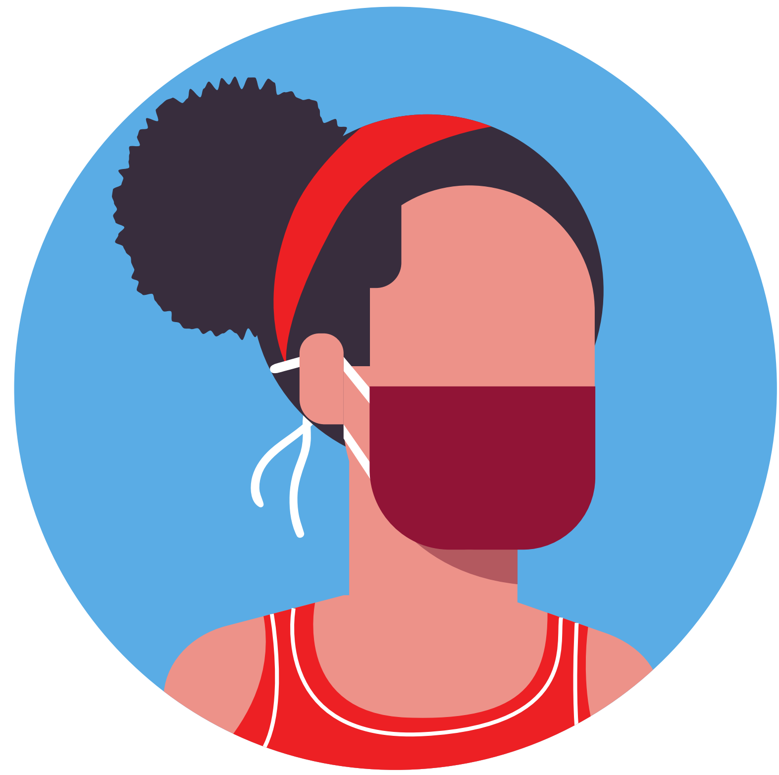
Wear a cloth face cover