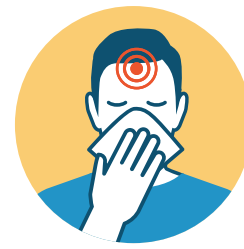
CONGESTION OR RUNNY NOSE