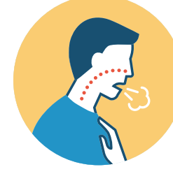
SHORTNESS OF BREATH OR DIFFICULTY BREATHING