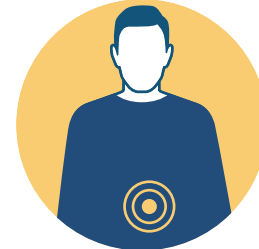
DIARRHEA, VOMITING OR ABDOMINAL PAIN

*especially new onset, uncontrolled cough