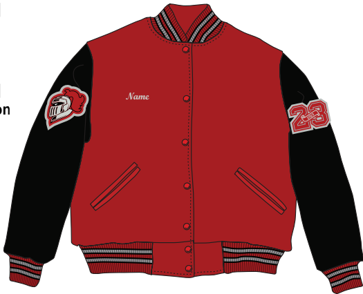
Scarlet wool Body, Black Leather sleeves, and Knit Collar.