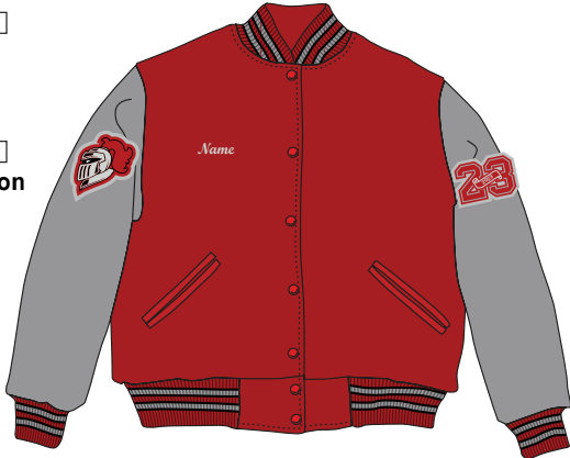
Scarlet wool Body, Grey Leather sleeves, and Knit Collar.