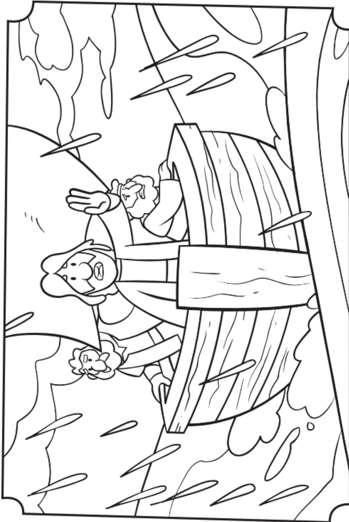
Jesus calmed a storm while He and His disciples were on a boat. Mark 4:35-41