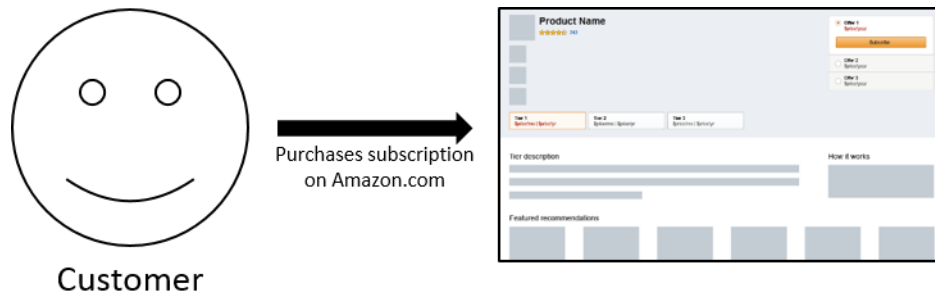
Figure 1: First, the customer purchases the subscription on Amazon.com from an SWA seller.

SWA allows customers to subscribe to your products on Amazon.com using their Amazon account. Amazon manages the billing relationship with customers, as well as managing subscription lifecycle events such as activation, renewal, and cancellation. Sellers are responsible for allowing customers to log in with their Amazon accounts and providing service to active subscribers based on the subscription status maintained by Amazon.