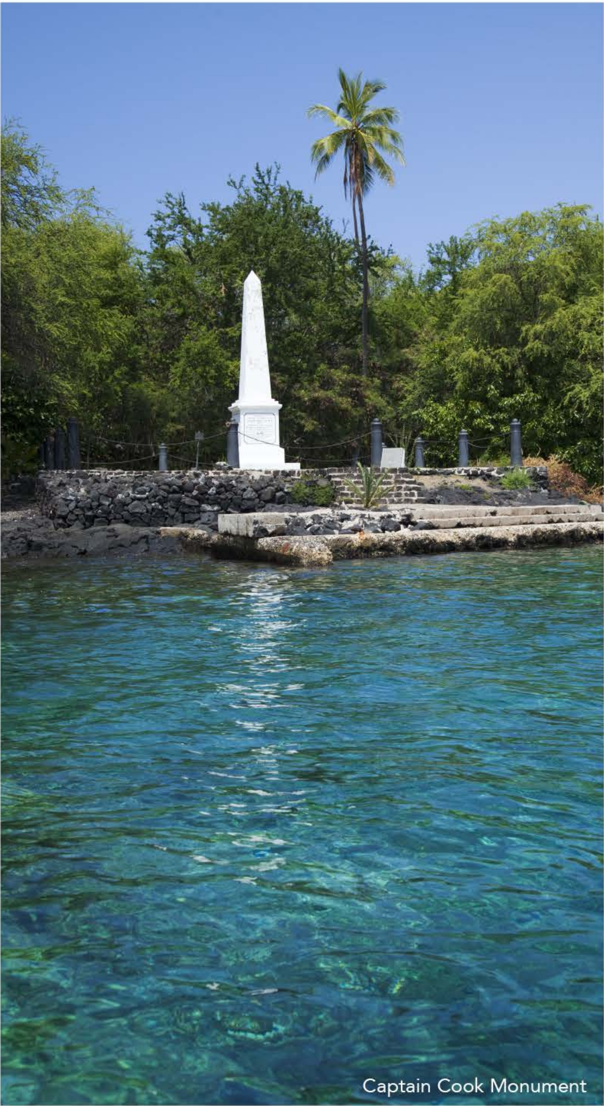
Captain Cook Monument