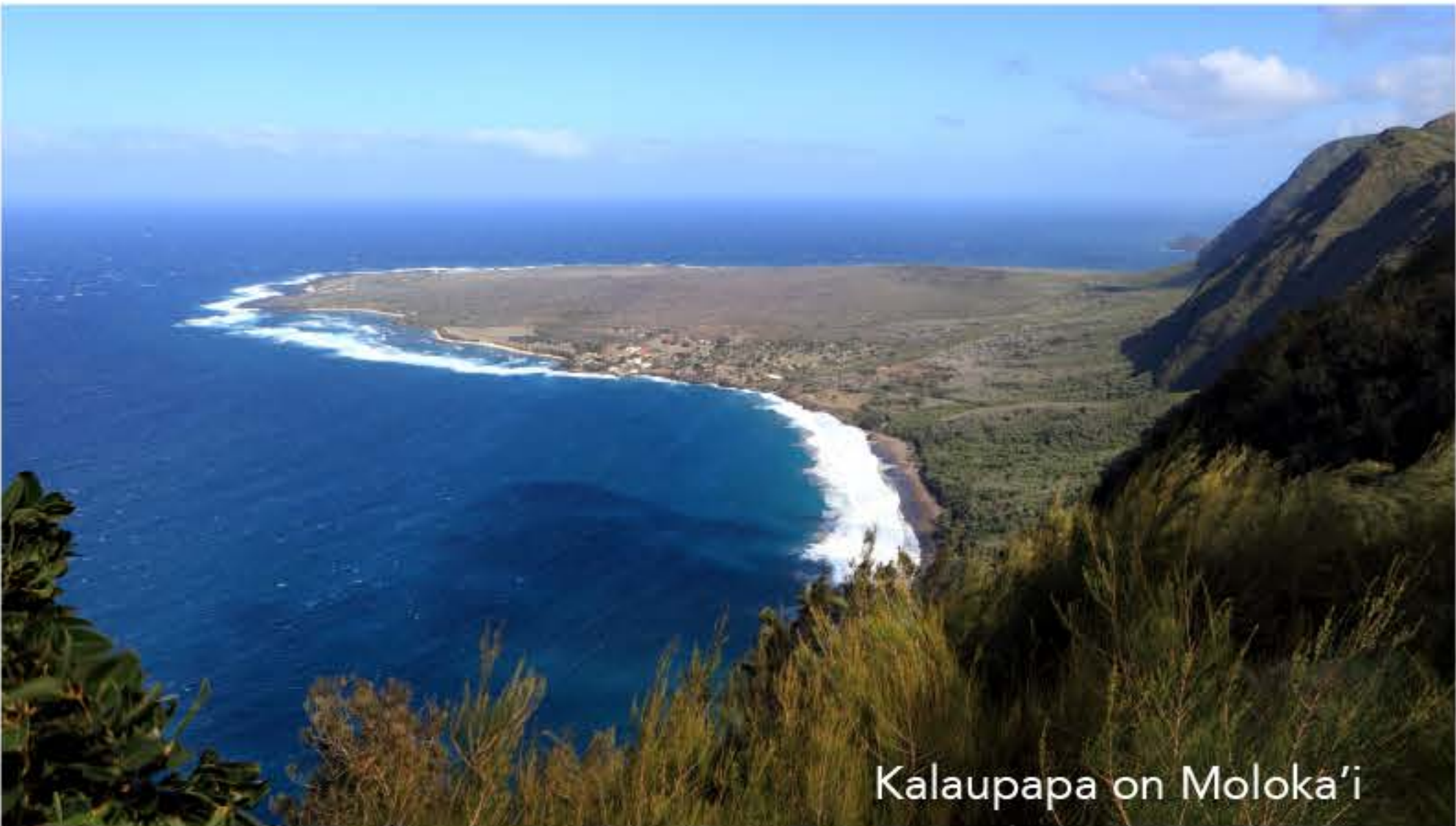
Kalaupapa on Moloka'i