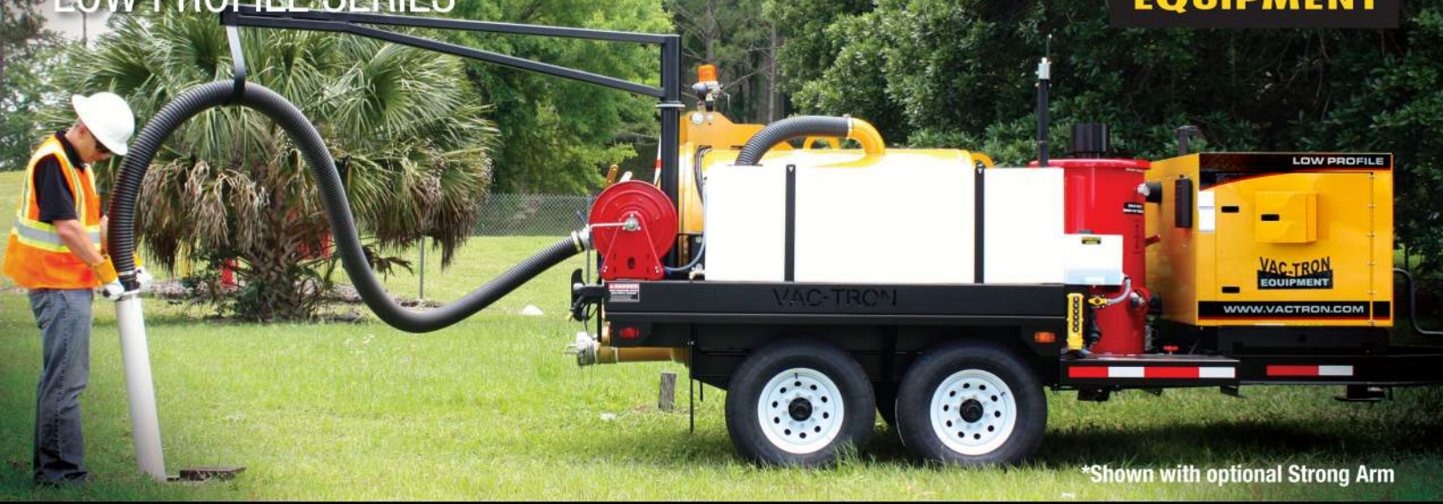
*Shown with optional Strong Arm