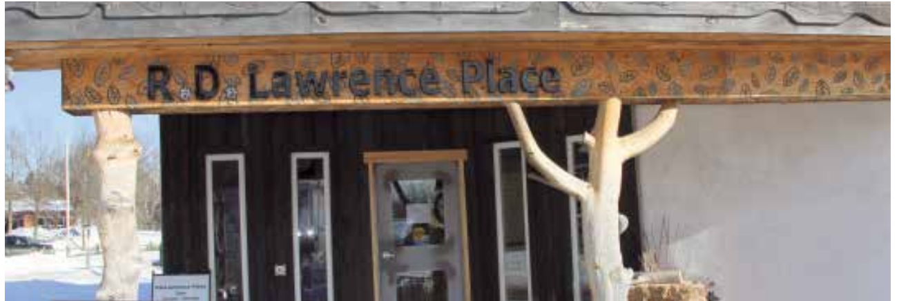
RD Lawrence Place in Minden Hills.