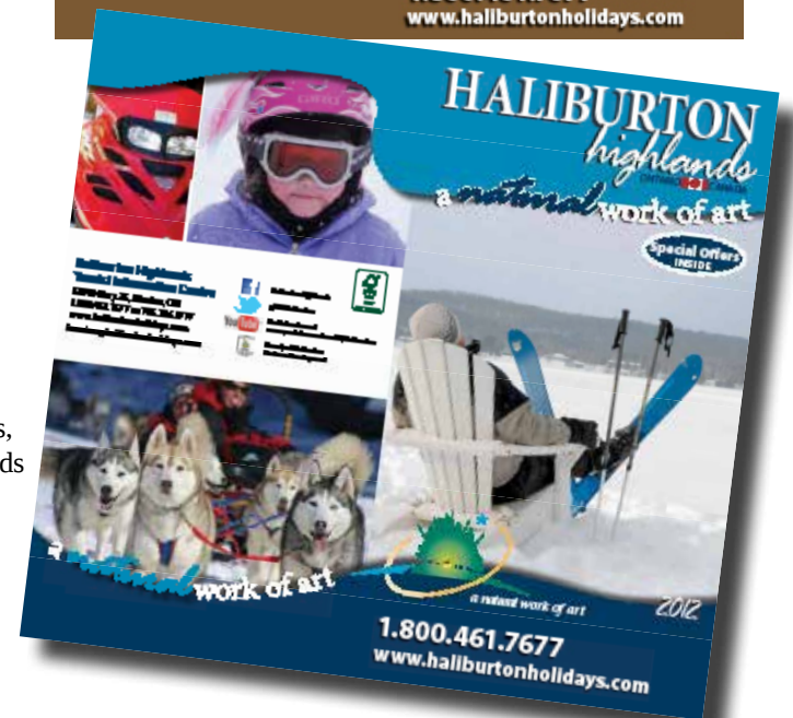
Summer and Winter covers for the 2012 Destination Guide.