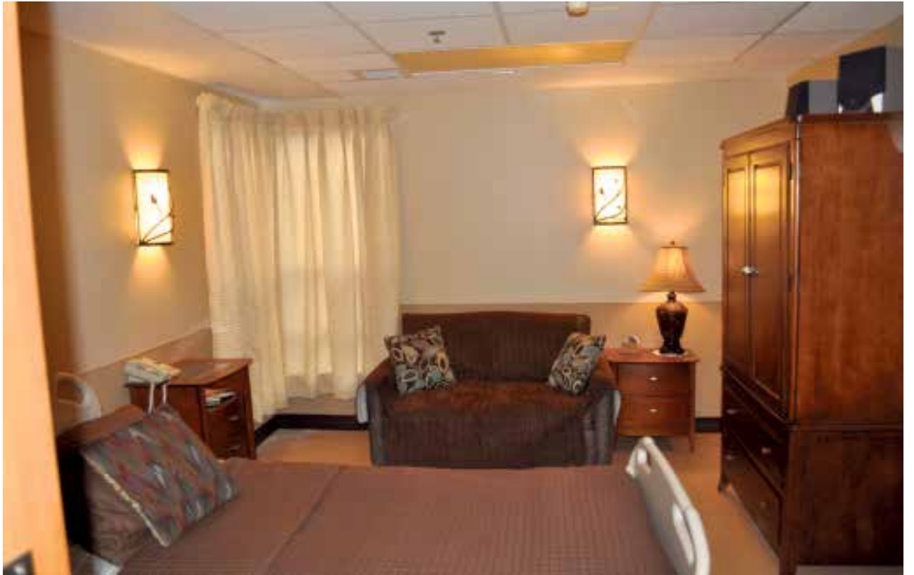
The Phase One palliative care suite at the Haliburton Hospital.

"We're already finding that we're getting numerous referrals from the hospital when someone's discharged and can go home with the expectation that we'll be