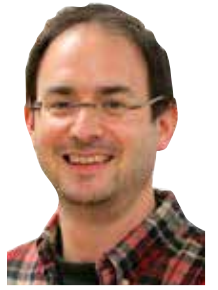
By Bram Lebo

It's a perfect case of knowing the price of everything and the value of nothing.