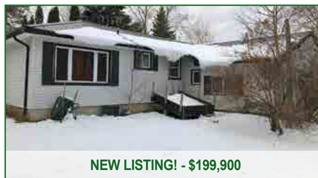
NEW LISTING! - $199,900

Excellent opportunity for the handy person. This one bedroom, 2 bathroom starter or retirement home is situated on a quiet street just off Highway 35. Features include kitchen and dining area, large bright living room with walkout to deck, laundry room and huge bedroom with 2 piece ensuite and wood stove. The large double lot offers privacy and the attached 26' x 24' garage and woodshed provide additional space. Municipal water and septic. Centrally located in Norland with easy commuting distance to Haliburton/Minden, Lindsay or Orillia.