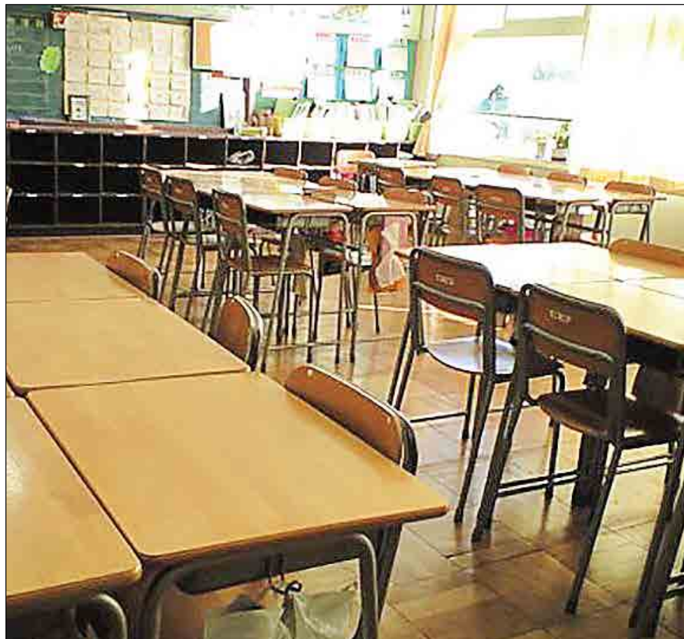
The Trillium Lakeland District School Board will not offer the Tutors in the Classroom program this year after funding cuts from the Ministry of Education announced in December.