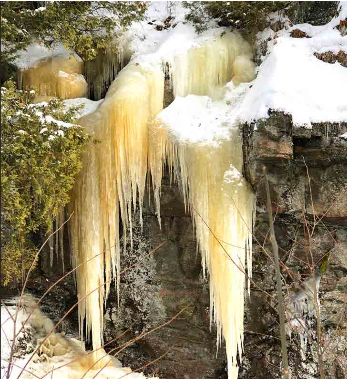
Icicles forming along a cliffside.