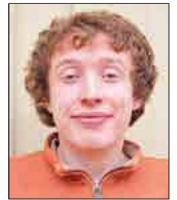
By Joseph Quigley

Minden council has a difficult decision ahead and is already grappling with questions of affordability. But any final efforts from members of the public should take into account all aspects of the decision, lest they be dismissed at this late stage.