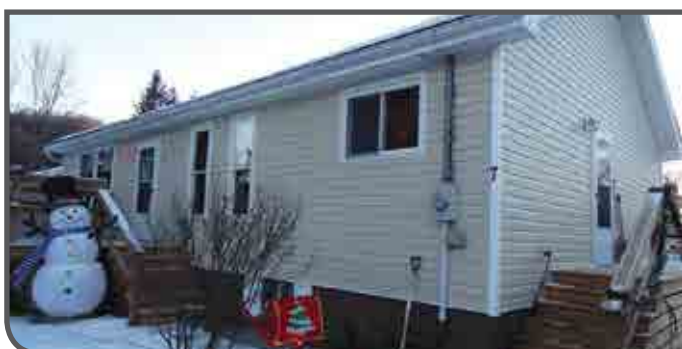
MINDEN HOME - $269,000