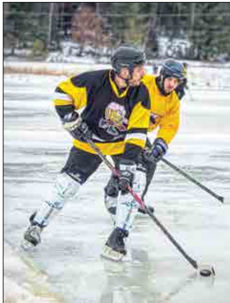
The Canadian National Pond Hockey championships at the Pinestone. File photo.