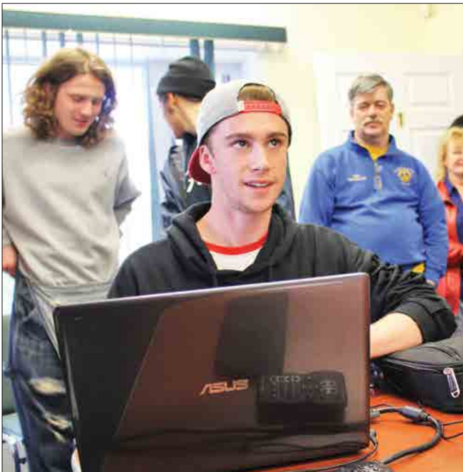
The youth hub gets the go-ahead in Haliburton. File photo.