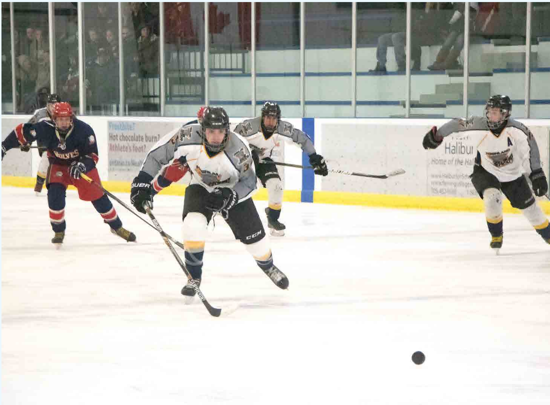
The Highlander/Ed Smolen Family Dentistry Midgets advance to the next playoff round.