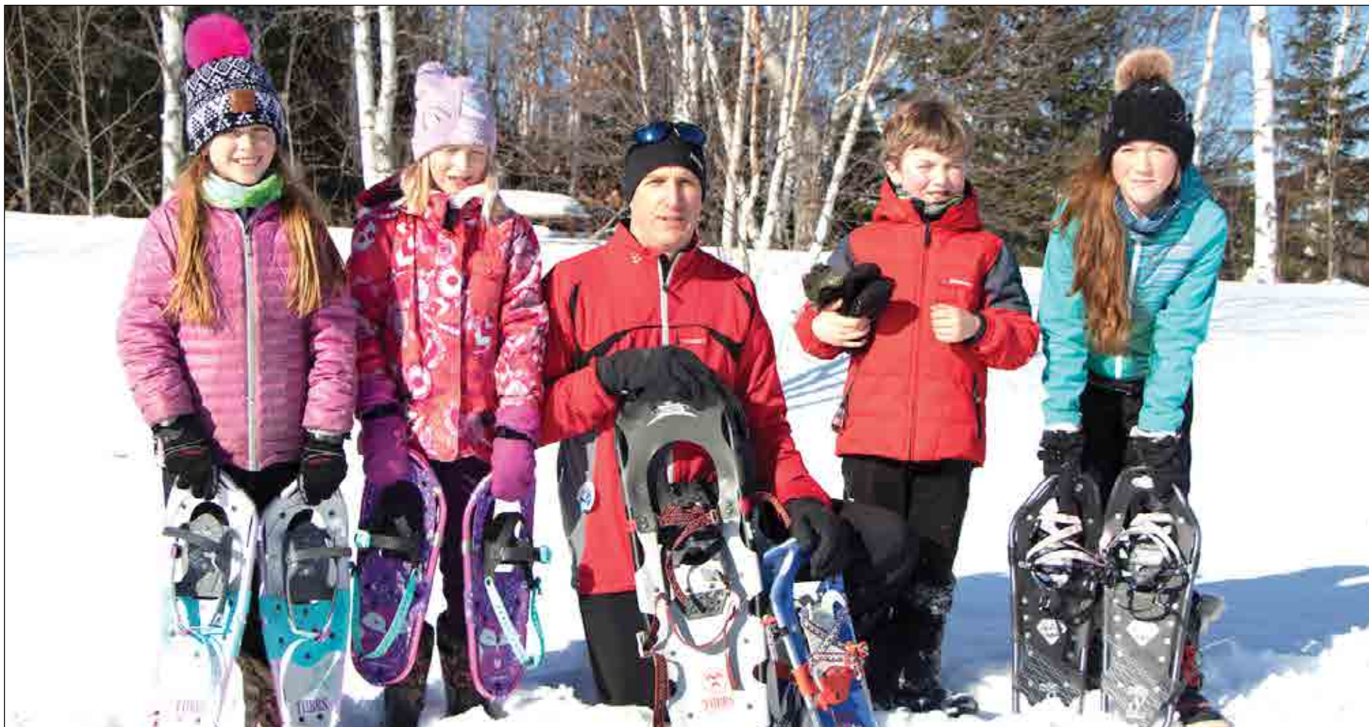
Families gathered after completing the Ontario Cup Snowshoe Race this past Saturday at Abbey Gardens. People competed in either a 5K or 10K race. Abbey Gardens hopes to host the event next year.

INSIDE: DYSART LOOKS AT SHORT-TERM RENTALS PAGE 3