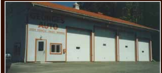
COMMERCIAL/RETAIL BUILDING - $539,000

This site lends itself to many retail uses, is serviced by town sewers and stands out as the most visible 'red roof'.