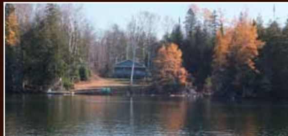
900 ACRE COMPOUND/CAMP $2,395,000

Self contained lake with 3 waterfront cottages & 1 chalet. This is the ultimate family retreat. Could be divided or developed.